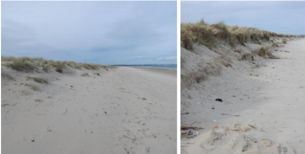
Figure 1: During the summer the dunes at Knoll beach take on a smoother convex shape as sand accumulates during calm weather (left) When these dunes are eroded during storms, they take on a steeper concave shape (right) also known as 'cliffing'.

We know that in some places (near the training bank, for example) the beach is accreting at a rate of about 1 m per year; however as a whole the system is losing sediment.